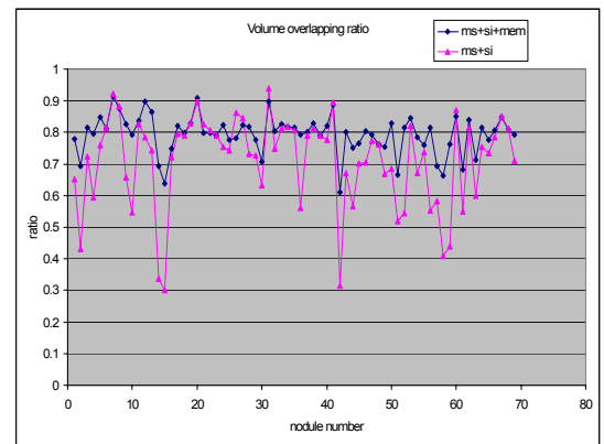
Fig.2. Volume overlap ratio based on the two different methods. The mean overlap ratio over the whole dataset for the proposed method is 0.80; and 0.71 for using MEM on the mean shift map without shape feature.