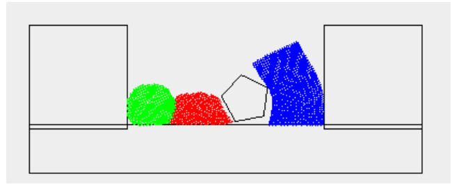
Figure 3: Example of Elastic Particles reacting to the force and pressure exerted upon them by a rigid body

Following the design and testing of these initial widget prototypes, both libraries offer unique potential for further usage. The Matter.js physics library provides the most robust set of data points and event callbacks for mapping to